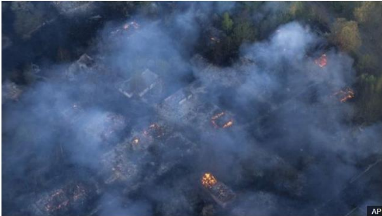
Villages abandoned after the 1986 disaster were consumed by the forest fire

A fire has broken out in woods near Ukraine's disused Chernobyl nuclear plant, the site of a meltdown in 1986.